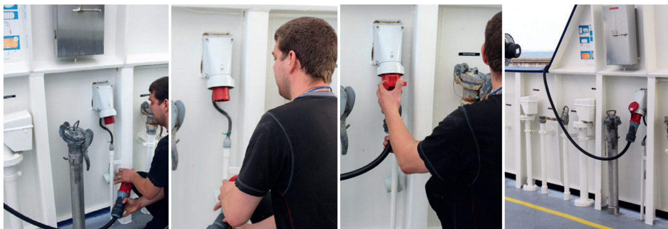
Staff connect to the shore power supply to commence charging the battery bank.

Furthermore, these batteries have a long lifetime of minimum 10 years, at a high volume of charging cycles (1 cycle = fully charged to fully discharged and back to fully charged).