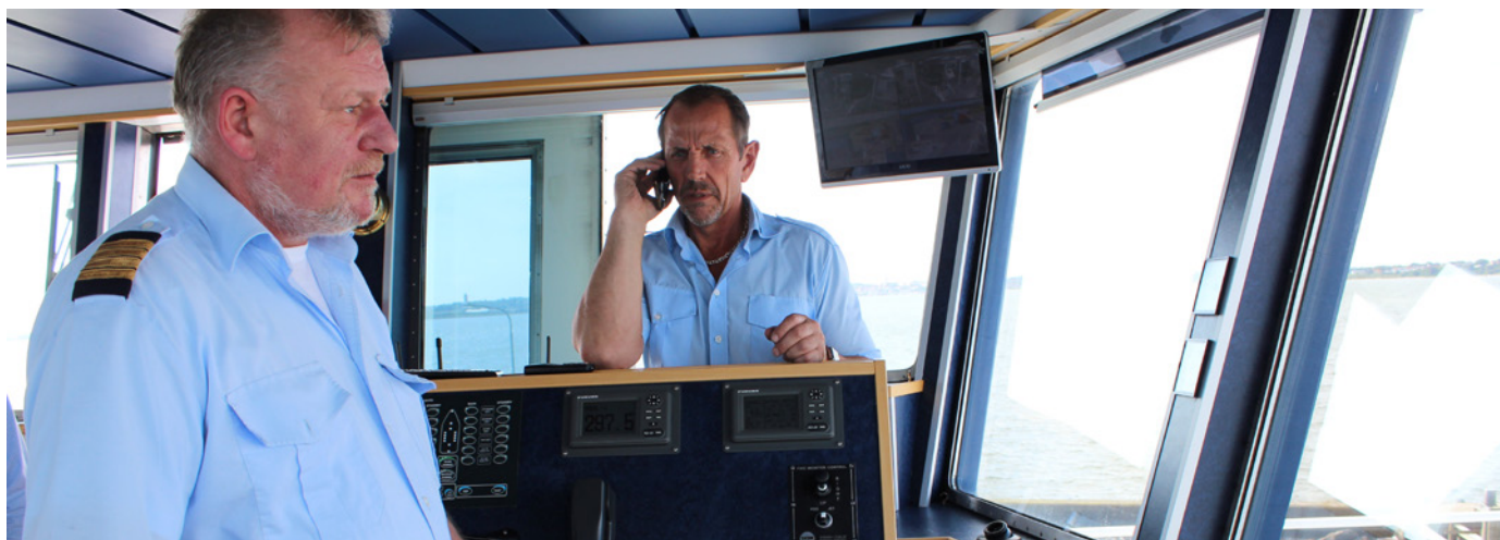
On the bridge