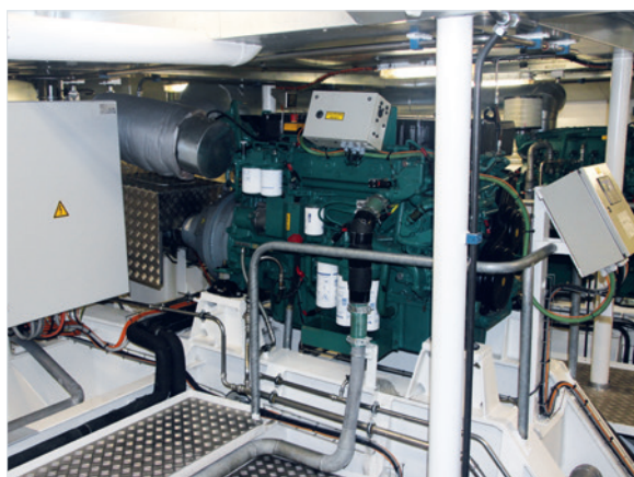
Volvo Penta marine diesel engine.

The double-ended ferry is powered by two identical Volvo Penta marine diesel engines with Schottel azimuth thrusters at each end of the vessel; each with its own engine room. There is full redundancy of the diesel propulsion.